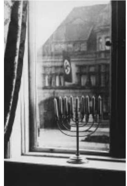
Greater German Reich, late 1930s

The German government remilitarized the country—in flagrant violation of the Versailles Treaty that had ended World War I. Great Britain, France, and other European nations permitted this violation as part of their policy of “appeasement” of Hitler, through which the war-weary governments hoped to avoid a direct conflict with Germany. For the same reason, they also did not stop the annexation of Austria in March 1938 (known as the Anschluss ) and the dismantling and subjugation of Czechoslovakia in September 1938 and March 1939.