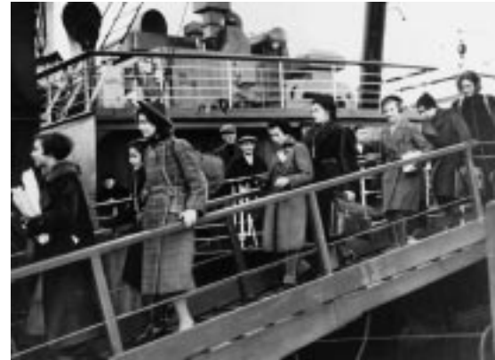
Kinder arriving at Harwich, England, December 2, 1938

In all, the Kindertransport rescue operation brought approximately 10,000 children to the relative safety of Great Britain—a large-scale act of mercy unique in a tragic historical period marked by brutality and widespread indifference.