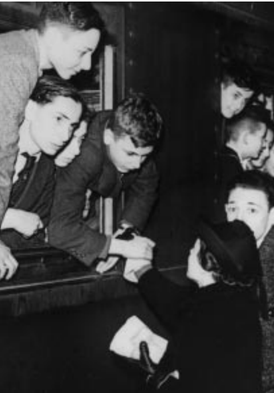
Dutch women greet Kinder at border

applications. But strict conditions were placed upon the entry of the children. The agencies promised to fund the operation and to ensure that none of the refugees would become a financial burden on the public. Every child would have a guarantee of 50 British pounds (approximately $1,500 in today's currency) to finance his or her eventual re-emigration, as it was expected the children would stay in the country only temporarily.